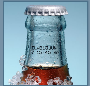
Removable continuous inkjet code on glass, enabling bottle reuse.

Our diverse portfolio of marking and coding solutions help you minimize your environmental footprint throughout the entire product's lifecycle, enabling you to meet your sustainability objectives. Whether your objective is to lower the energy consumption of your production line, reduce the waste associated with consumables such as inks and ribbons, or increase recyclability of your waste or reduce VOC emissions from your line, we can help you understand the trade-offs and assist you in finding the right printing solution that minimizes your footprint.