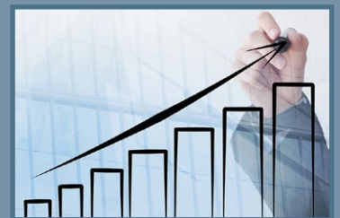
Increased uptime enabling efficient resource use.