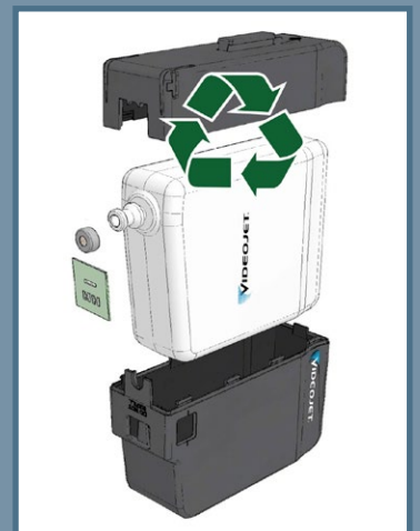
Videojet cartridges are designed for recyclability.